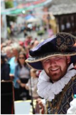
The Mayor Josh Dickin