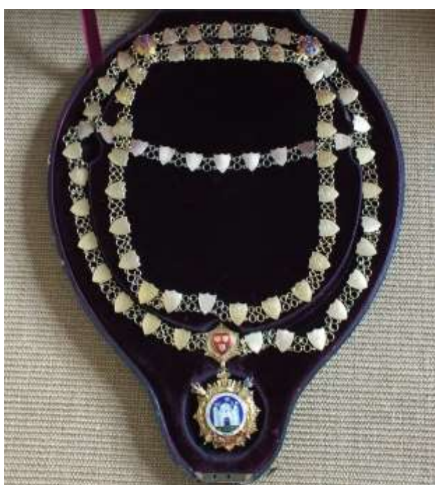
now be viewed on in the Town Hall.

These items of Bishop's Castle Town Council's regalia have until recently been on deposit with the HSBC bank for security reasons. They were only on public display twice a year, once for