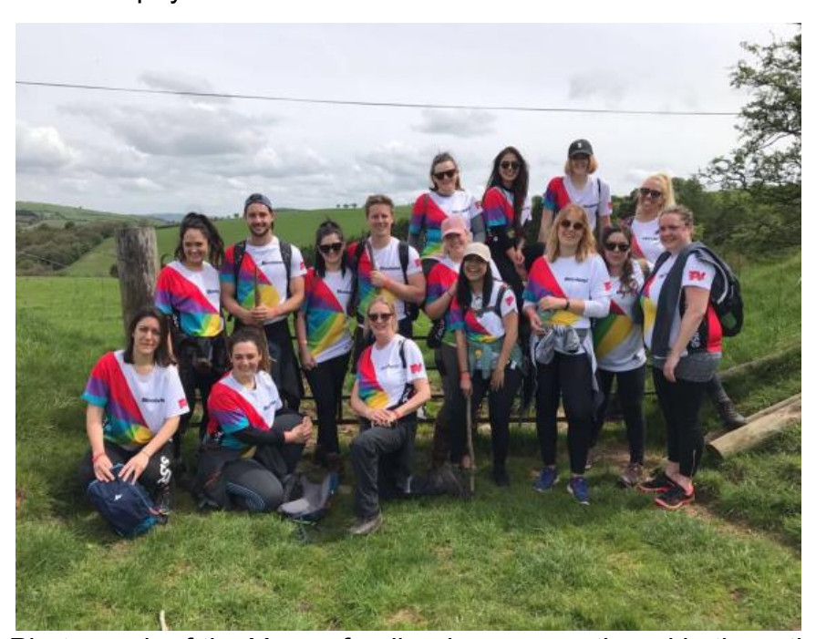
Photograph of the Young family who are mentioned in the article

Walkers pay for the pleasure, so are under no obligation to gain sponsorship, but each year a few people choose to do so. This year, sponsorship totalled £15,000 with two people collecting well over £1,000 each and the family and friends of one young man collecting some £11,000. In this case, 25 Londoners, mostly in their 20s, undertook the Scramble to Clun. They were not experienced walkers, and suffered more than their fair share of blisters, but met their target - a token of the supportive framework of the walk itself. They were also, although from a variety of very different backgrounds, new to Shropshire and overwhelmed by its beauty and friendliness. Several of them wanted to pay for sustenance donated to us.